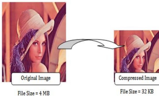
Fig. 3. Result of Image Compression Tool

In our proposed work we adjust the DPI for multiple Screen and it will not loss the quality of image because we resize the image. resizing an image changes the size of its pixels, not its number of pixels[12]. We're not increasing or decreasing the number of pixels. The final output for the proposed system looks like this in a mobile device of android: