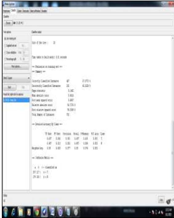
Figure 4: Output

The accuracy is around 58%. The kappa statistic measures the agreement of prediction with the true class where value 1.0 signifies complete agreement. The confusion matrix or contingency table in this example has thirteen classes, and therefore a 13x13 confusion matrix is being displayed. The number of correctly classified instances is the sum of diagonals in the matrix; all others are incorrectly classified. The True Positive (TP) rate is the proportion of examples which were classified as class x, among all examples which truly have class x, i.e. how much part of the class was captured. It is equivalent to Recall. The False Positive (FP) rate is the proportion of examples which were classified as class x, but belong to a different class, among all examples which are not of class x. The Precision is the proportion of the examples which truly have class x among all those which were classified as class x. The F-Measure is simply 2 * \text{Precision} * \text{Recall} / (\text{Precision} + \text{Recall}) , a combined measure for precision and recall.[8]